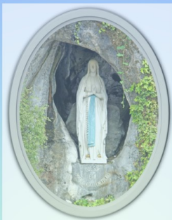
Our Lady of Lourdes Tuesday 11th February World Day of the Sick

ACCORD Dublin needs your support this year more than ever. Please give generously on 15th & 16th February 2025